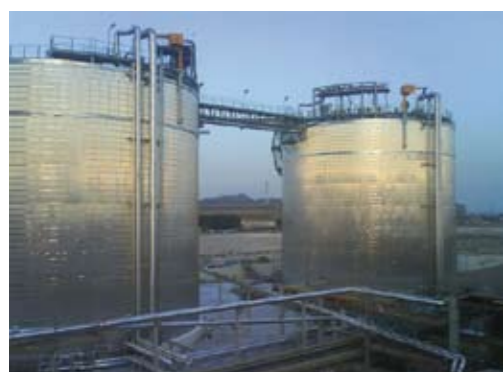
Liquid Pitch Marine Terminal