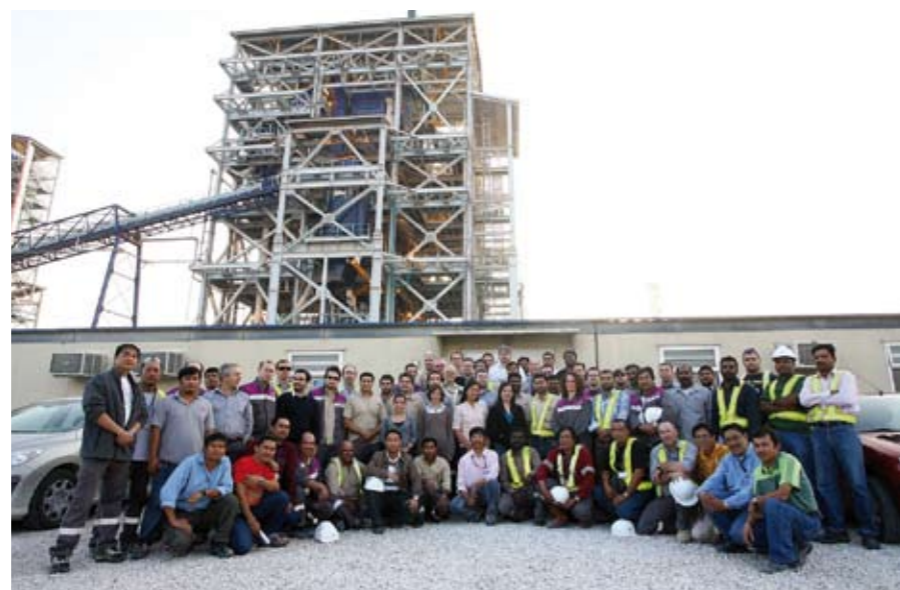
Fives Solios team in front of the High Capacity Green Anode Plant