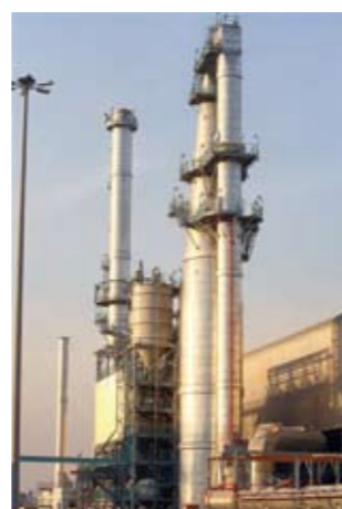
Fume Treatment Center