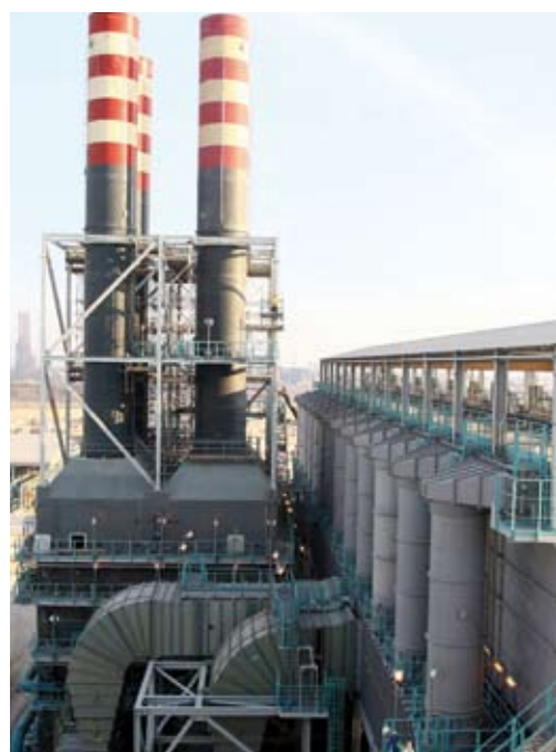
Gas Treatment Center with Sea Water Scrubbers

In order to meet Qatalum's objective, to produce first metal before the end of 2009, the first Fume Treatment Plant (GTC) was started on the 15 th of December to treat the gas coming from the electrolysis pots. ■