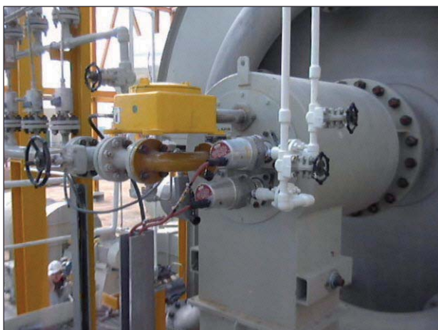
Fig.3 - Incinerator burner, Fuel gas fired