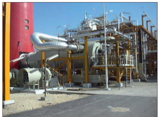
Fig.4 - Incinerator package, 34 380 (n)m 3 /h of tail gas