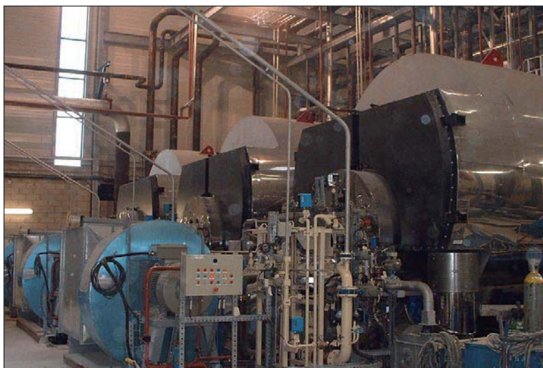
Fig.2: PILLARD GRX V2 ultra low-NOx type burners

The GRX-V2 burner is the subject of a PILLARD patent (n° FR 03/14694). The technology uses combustion air injection staging together with flue gas recirculation (FGR) without an air fan - the flue gas duct being integrated in the burner.