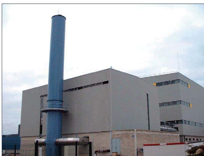
Fig.1: Outside view of the EMIN LEYDIER boiler house Nogent-sur-Seine factory, (10) France

- Diesel oil: NOx < 200 mg/Nm 3 CO < 100 mg/Nm 3