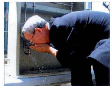
President Dae-joong Kim, drinking water produced from the world's largest Fujairah Water and Power Plant

Doosan plans to gradually increase the Fujairah Desalination Plant's water production capacity, which will be fully operational starting from the middle of May, to reach a maximum level of over 12.5 MIGD (Million Imperial Gallon Per Day) of fresh water daily.