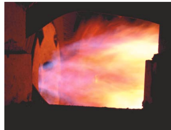
► View of a flame. One of the boilers of the Braila Thermal Power Station.

The official measurement campaign for emission control was carried out in April and May 2003 (see Table 2). The NOx