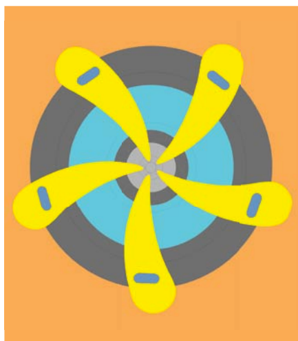
► Split flames principle (Pillard patent)

emissions varied from 355 to 402 mg/Nm 3 at 3 % O 2 when firing heavy-oil, from 189 to 244 mg/Nm 3 at 3 % O 2 when firing natural gas, and from 196 to 379 mg/Nm 3 when firing in dual fuel mode, heavy-oil and gas together. Such values are much lower than the limits required by the new EC standards in spite of the use of very hot combustion air at 280°C.