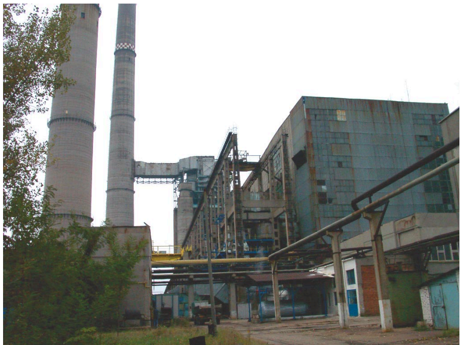
► View of the BRAILA Thermal Power Station (south-east of Romania).

Complying existing boilers to the decree taken on July 30th, 2003 (European Directive 2001/80/CE) often implies removing and replacing their oil or dual-fuel burners by new higher performance models. In many cases, nitrogen oxide emissions can be reduced by over half, without a loss in efficiency.