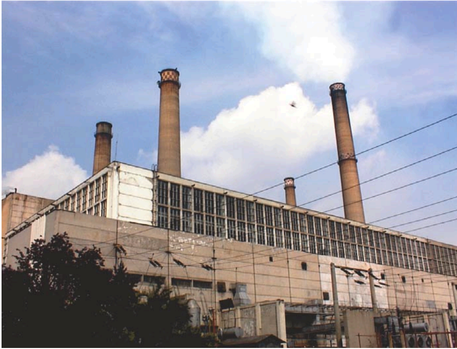
► View of the Bucharest-South Thermal Power Station.

temperature, and to increase the internal flue gas recirculation into each elementary flame segment, thus reducing the local O_2 content.