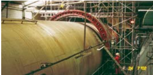
Supply and replacement of the path ring of a RT diffuser