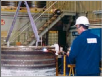
Repair of a batch centrifugal basket after evaluation