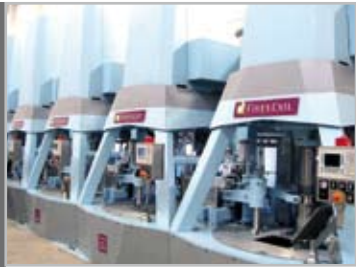
ZUKA® battery - TURKEY